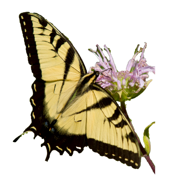
Eastern Tiger Swallowtail Butterfly