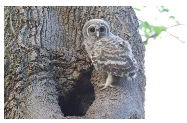
A single barred owl youngster emerges from nest cavity.