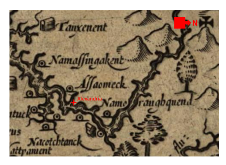
Zoomed in map of Alexandria derived from image shown in the previous map. SOURCE: "Alexandria and John Smith's Map." Office of Historic Alexandria.

While the Doegs eventually left by force or displacement by colonists from their lands, their memory lives on in some names that remain: Dogue Creek; Occoquan ("at the end of the water"); Marumsco ("at the island rock"); Quantico ("by the long stream"); and Potomac ("trader"). These names, which have endured through the centuries, serve as a powerful reminder of the enduring legacy of the Doeg people. They connect us to the past and the rich history of this region, reinforcing the historical significance of the Doeg people and their contributions to the region.