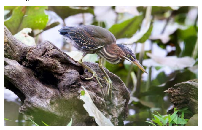
A recently fledged green heron with parent (not in photo) near the Haul Road Trail footbridge.

Despite the concentration in a smaller area, least bitterns successfully bred in the upper portion of the Big Gut in 2023. On July 15, a kayak surveyor reported a total of four fledged young perhaps representing at least two family groups. The surveyor noted that some of the youngsters were found in the "Northeast Passage," a narrow tributary of the Big Gut that over the years has seemed to be a favorite nesting location for least bitterns. The remaining young were at a location we call "Heron Hook," the farthest south least bitterns are now being reported and about halfway up the Big Gut.