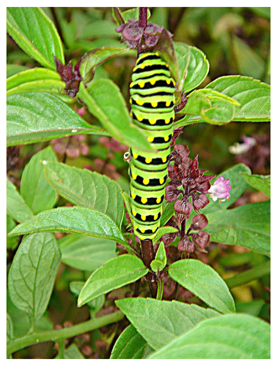
Tiger swallowtail caterpillar ( Papilio glaucus)