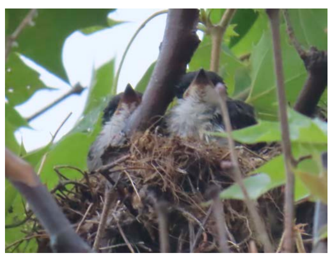
Two eastern kingbird nestlings occupy a nest along boardwalk at the end of the Haul Road Trail.

(double-clutched). They apparently used a combination of reduced brood size and an alternate prey base. Eastern kingbirds have a maximum clutch size of five eggs and generally feed older nestlings and fledglings odonates (dragonflies and damselflies).