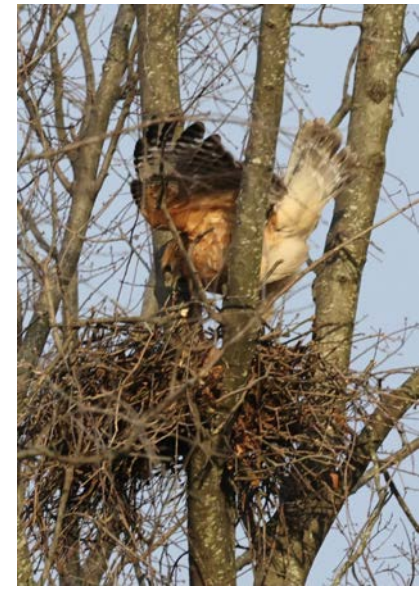
Red-shouldered hawk nest construction near the south parking lot at Belle Haven Park picnic area.

We use safe dates as a means of deciding if a bird can be considered a breeder or a migrant. Safe dates are simply defined as a period beginning when all members of a given species have ceased to migrate in the spring and ending when they begin to migrate in the fall. Unless a bird is engaged in behavior that confirms breeding, it will be placed no higher than in the possible breeder category if it is observed outside the safe dates assigned to that species.