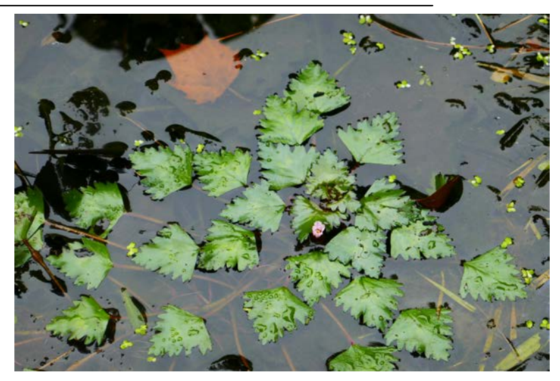
Two-horned water chestnut with pink flower

Once in a waterbody, it is capable of covering the shallows like a blanket within two or three years. In 2014, wildlife biologists observed a patch in the tidal Potomac River at Pohick Bay near Lorton. Starting then, the Virginia Department of Wildlife Resources harvested the plants annually and eradicated them by 2018. However, surveys in Fairfax County revealed it was harboring in regional ponds and lakes. The number of colonized ponds was doubling annually. At that rate, water