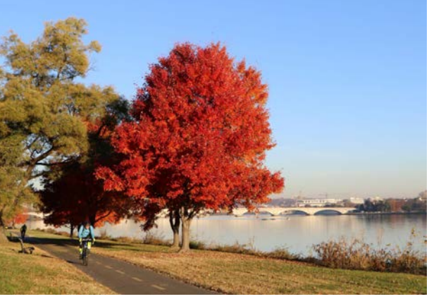
Fall colors along the GW Memorial Parkway and the Potomac River

Among other ecological services, trees stem runoff, stabilize soils and absorb excess nutrients from runoff. Trees are "carbon sinks," consuming more carbon dioxide, a greenhouse or heat-trapping gas, than they emit. Trees absorb other pollutants like ozone, carbon monoxide and sulfur dioxide.