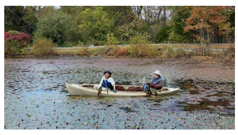
Harvesting two-horned water chestnut plants in Manassas

Fortunately, in 2023, the Virginia Department of Agriculture and Consumer Services (VDACS) and the Northern Virginia Soil and Water Conservation District funded control programs for ponds colonized by two-horned water chestnut. In 2024, Virginia declared this plant a Tier II noxious weed, which prohibits movement and sale within the state without a permit. Currently, most of the colonized ponds are under management plans. However, it takes several years of management to completely eradicate the plant. Management must occur before plants drop seeds for next year's crop and some seeds may remain dormant in the sediment for several years.