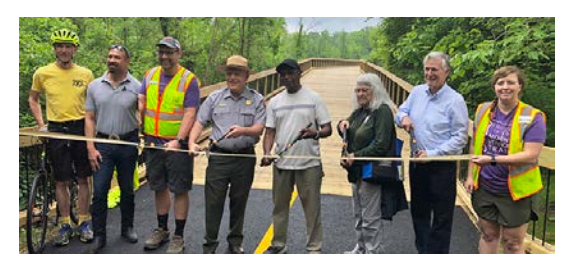
Ribbon-cutting ceremony

To read our related comments on NPS's Mount Vernon Trail construction, visit https://www.fodm.org/images/GWMParkwayRehabEAFODMOct2023.pdf